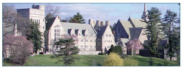
Bryn Mawr College is located in Bryn Mawr, Pennsylvania - 11 miles from Philadelphia. Founded in 1885, it is one of the world's most distinctive, distinguished liberal arts colleges. The campus includes 50 buildings on 120 acres.

America's institutions of higher education spend a significant portion of their annual operating budgets on utility services, diverting funds from valuable education programs and community-building activities. In 2003, Bryn Mawr College, a long-time advocate of conservation, decided it could do better. It embarked on a five-year plan to improve control of its HVAC operations and upgrade the efficiency of its systems. Today, the College not only has a fully automated HVAC controls system, it is leveraging that system to cash in on its power supply and using the money to fund a variety of conservation and sustainability efforts on campus.