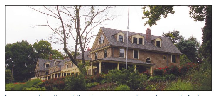
In one year alone, the curtailment program earned enough money to fund several energy efficiency programs including the development and demonstration of a windmill project.

Energy curtailment programs are particularly attractive to environmentally conscious institutions such as Bryn Mawr. Seen as an alternative to new