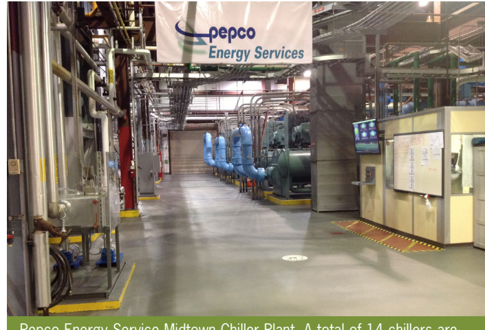
Pepco Energy Service Midtown Chiller Plant. A total of 14 chillers are in the plant—16,200T

Pepco Energy Services receives NJ SmartStart project rebate check for $500,000—the maximum allowable rebate.