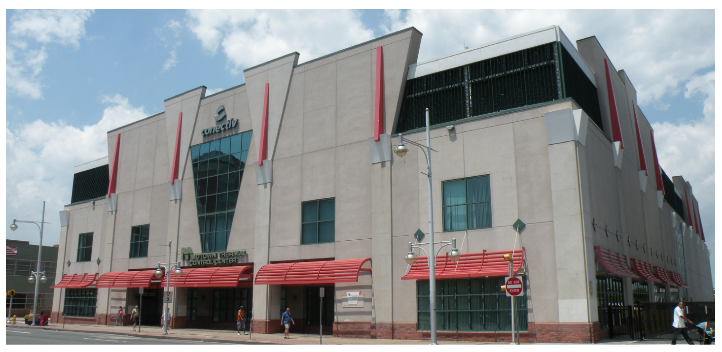
MTCC Chiller Plant | The chiller plant operates 24 hours per day, 365 days per year, providing essential chilled water via a 42" header to numerous Atlantic City casinos, Pier Shoppes and the Atlantic City Boardwalk Hall and Visitors Center. The 16,200 Ton plant has 4-York 4160v series counter flow chillers and 10-York 480v VSD series counter flow chillers. System pumping capacity is 40,000 GPM.

Pepco Energy Services' (PES) Midtown Thermal Control Center (MTCC) in Atlantic City, New Jersey, sells chilled water and steam to multiple Atlantic City casinos, Boardwalk Hall and Pier Shops. PES is also responsible for stand-alone remote heating and cooling plants for the Atlantic City's major casino's as well as the Atlantic City Convention Center including its 2.4 Mw solar array.