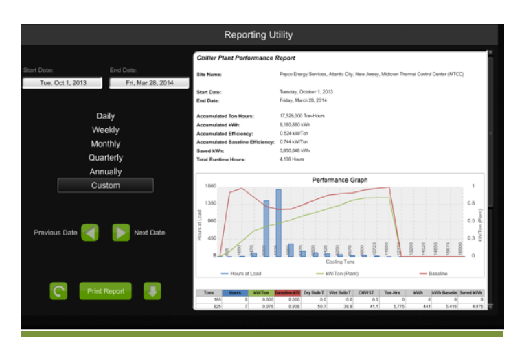
Baseline Performance Data: October 1, 2013 – July 31, 2014 (Total electric savings for the period 5,370,000 kwh)

Rauch understood that improvements in the chilled water production process would be evaluated in competition with other capital expenditure options under consideration by management. Because capital budgets are limited, it was vital that he accurately quantify the benefits to be achieved with the expenditure to gain approval to proceed.